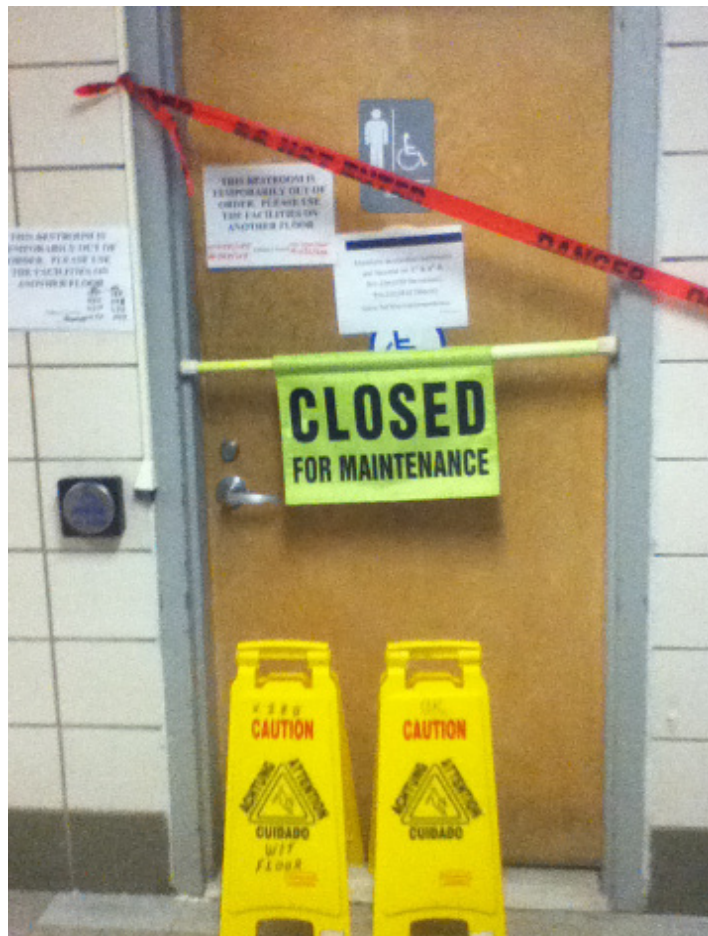
When students attempted to go to the bathroom on the first floor of Kiely Hall, they saw it closed.

The statement further said that while "blockages do not occur that frequently," when they