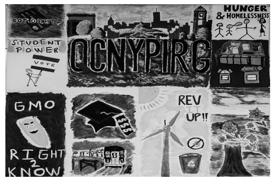
NYPIRG is just one of many activist groups at Queens College upholding the college's legacy of

Another organization on campus, NYPIRG, founded in 1973, is the largest student-directed research and advocacy organization in New York, with more than 85,000 members statewide. Their primary concerns consist of issues like environmental protection, higher education and voter registration.