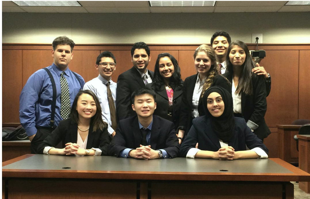
The mock trial team at Queens College is both a competitive, yet fun activity to do, according to the team members

The team operates under the supervision of the Pre-Law Association at QC, which provides advisement that includes helping students determine if a career in law is right for them, teaching how to successfully manage the