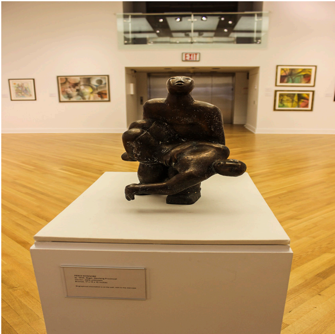
The Godwin-Ternbach Museum is currently hosting an exhibit on art from South Africa during the 1970s and 1980s until March 26