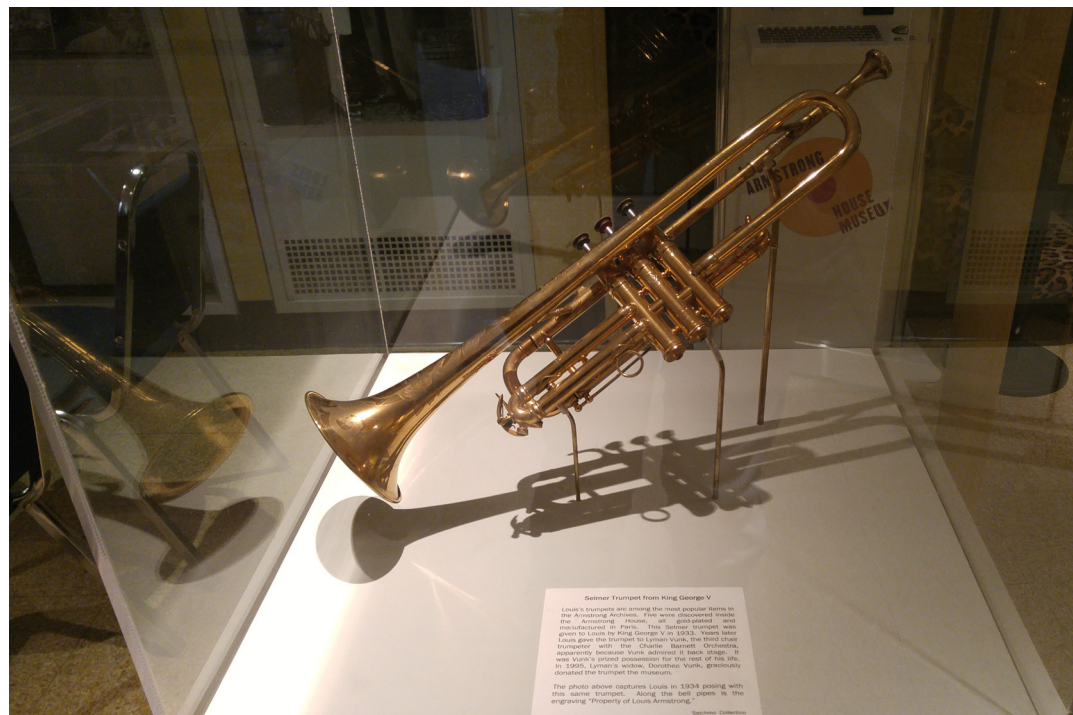
At Louis Armstrong House Museum, visitors can find valuable treasures like Armstrong's trumpet.

bathrooms are customized for the Armstrongs. The most expensive room of the house, the bathroom, is made out of solid gold.