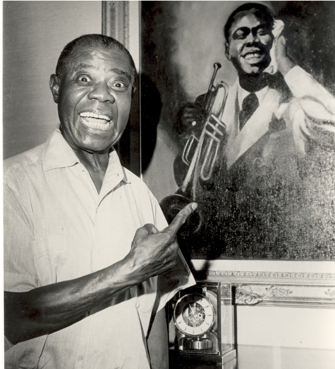
Louis Armstrong, a legendary jazz musician, poses next to a painting of him.