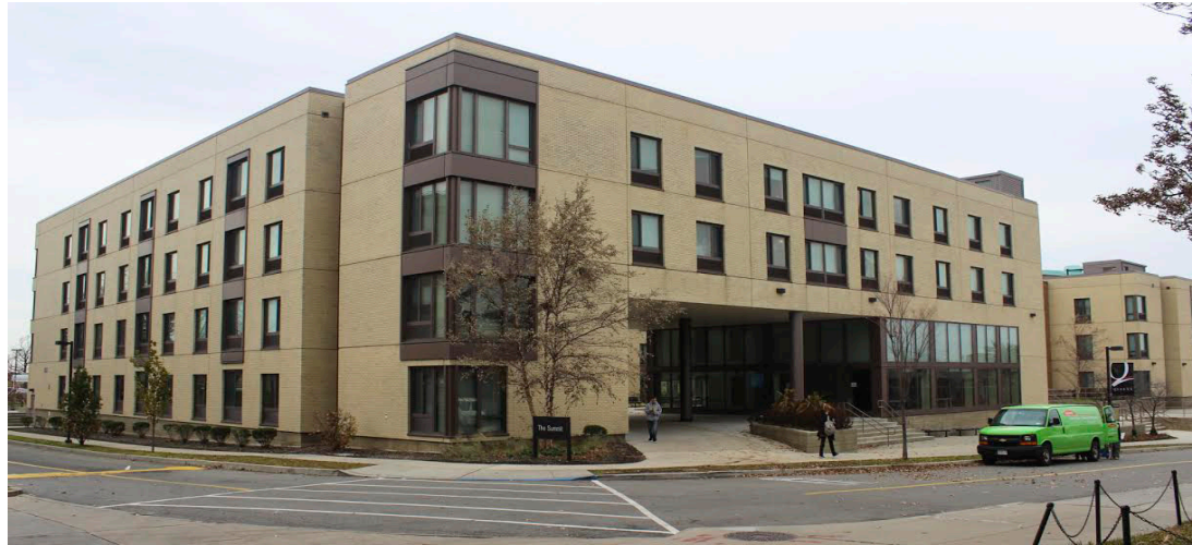
One of the biggest issues in The Summit is the lack of quality Wi-Fi, which has irritated students living there.