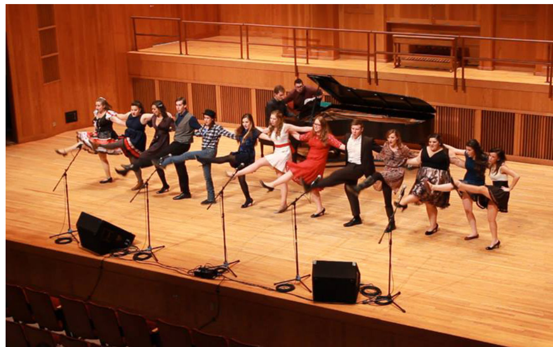
“A Little Night of Sondheim and Bernstein” was lively through many musical numbers such as “West Side Story.”

The show opened with the ensemble number “Comedy Tonight” from Stephen Sondheim’s “A Funny Thing Happened on the Way to the Forum.” Two