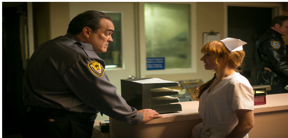
"The Lennon Report," which deals with what happened after John Lennon was shot, will debut next year on Dec. 8.

previously visited QC before for another film where he came across in Remsen Hall.