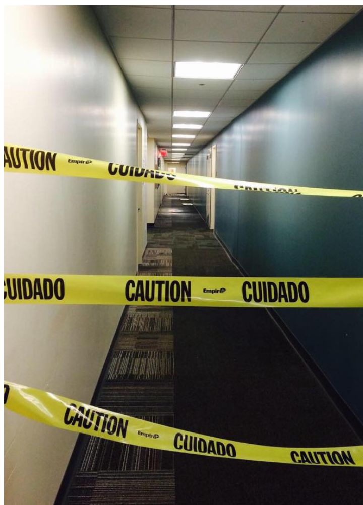
A small fire in The Summit led to some dorm rooms to be flooded.

"It's given me an experience I'll never forget. I moved to New York City from small town in Iowa and then next thing you know